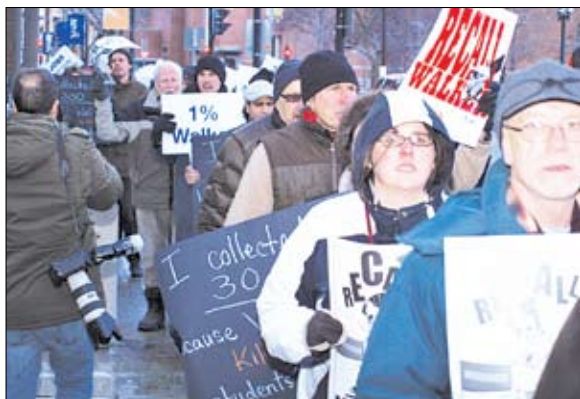
As landmark petitions were delivered in Madison January 17, an echo celebration took place on State St. in front of Milwaukee's MATC.